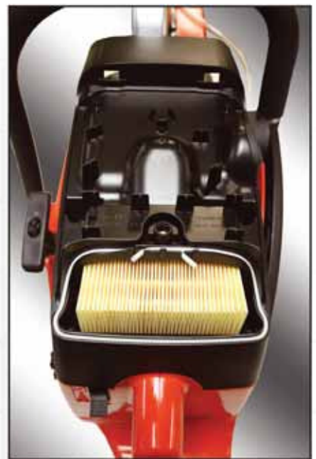
Larger initial foam filter along with upgraded main paper filter