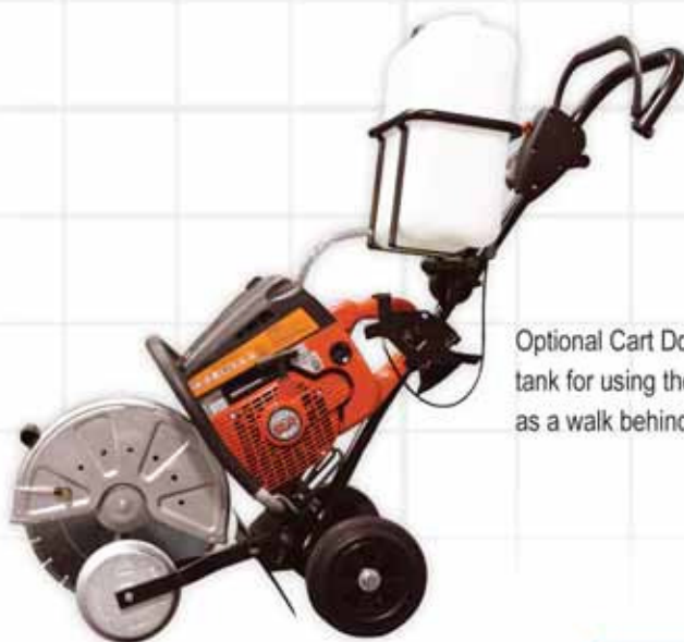
Optional Cart Dolly with water tank for using the Fast-Cut saw as a walk behind application

Modified Deco Valve, Carburetor and Improved Ignition Coil for Fast Starting